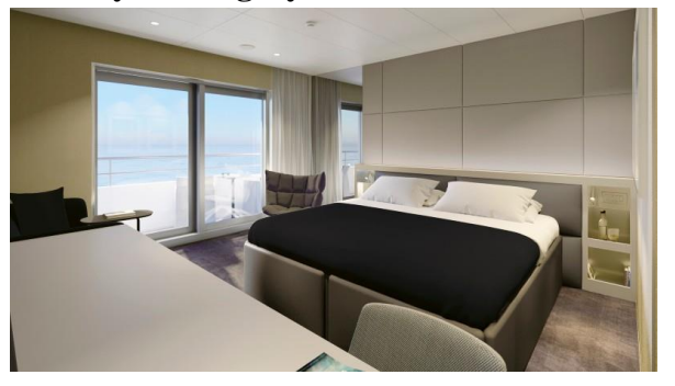
Balcony – Category A & B

Instantly settle in with a selection of included modern amenities and make the most of your close proximity to the Horizon Bar & Lounge.